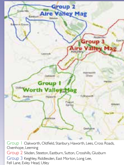
Group 1 Oakworth, Oldfield, Stanbury, Haworth, Lees, Cross Roads, Oxenhope, Leeming Group 2 Silsden, Steeton, Eastburn, Sutton, Crosshills, Glusburn Group 3 Keighley, Riddlesden, East Morton, Long Lee, Fell Lane, Exley Head, Utley